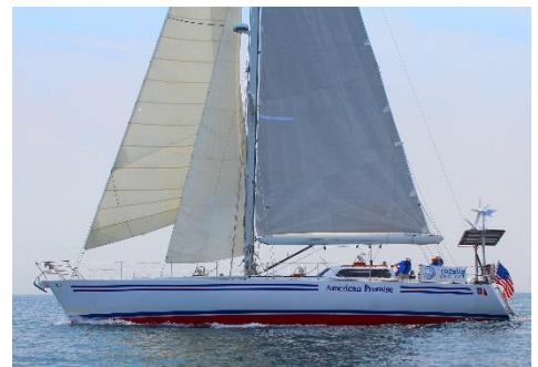
"American Promise" – Rozalia Project